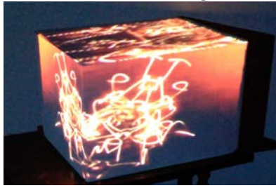
YouTube Video Lemon Jelly [12]