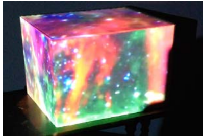
YouTube Video Black Sabbath [11]